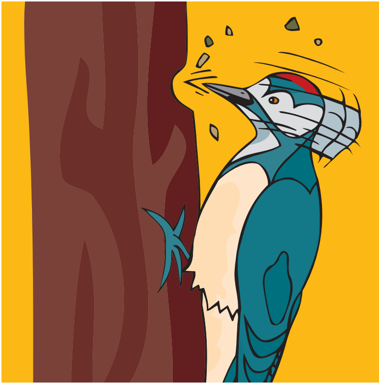
A woodpecker makes holes in trees.